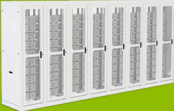
PHI HV Indoor Racks- Special Order with Doors

Field integrated solutions with inverters, racks and batteries, available in 10, 20, or 40-foot containers.