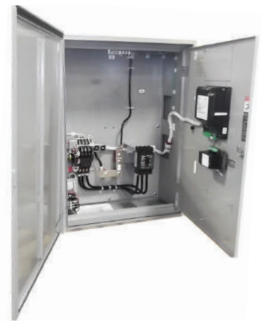
ASCO SERIES 300 SE Rated 200 amperes in Type 3R enclosure

ASCO SERIES 300SE products use two types of construction.