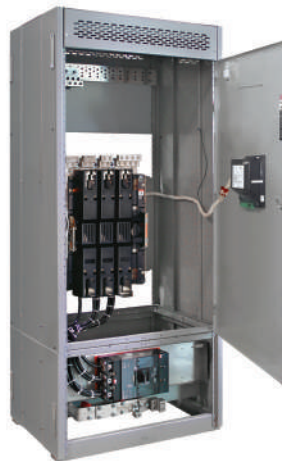
ASCO SERIES 300 SE Rated 800 amperes Type 1 enclosure