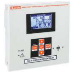
Automatic mains failure gen-set controllers RGK601